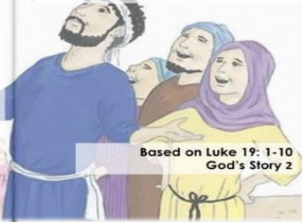
Based on Luke 19: 1-10 God's Story 2

Jesus smiled at him and said, "I am glad, Zacchaeus. This is indeed a happy day for you because I have come to your house today specially to help you change, so that you will please my Father."