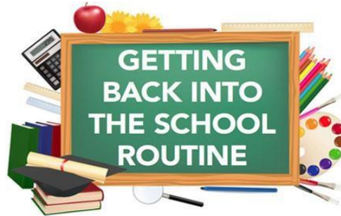
My New Classroom.

In September, my class and I will be moving to Year 6. My new classroom is 6TL.