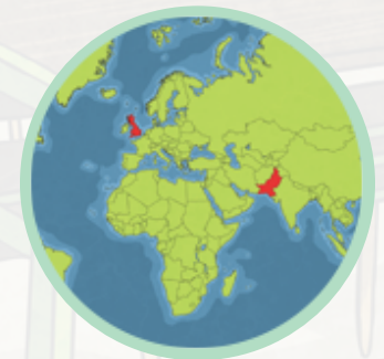
Map of Mingora, Pakistan.