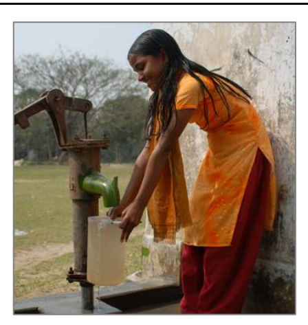
Access to clean water