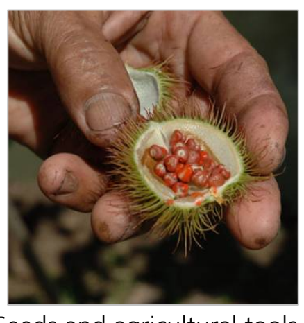
Seeds and agricultural tools