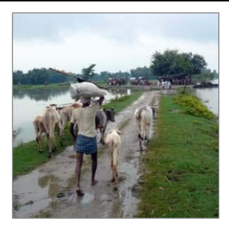
Country with high rainfall