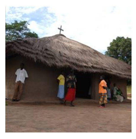
Somewhere to worship